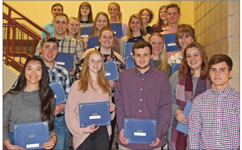
MVEC sends best wishes to the 2018 scholarship winners as they finish their first semester at college and tech school. 2019 applications can be found at www.mvec.net/our-community

Basin Electric, one of our wholesale power providers, has one $1,000 scholarship available. An essay and an outside appraisal are required. The Basin scholarship deadline is also Monday, Feb. 18. The recipient is chosen by Basin Electric in April.