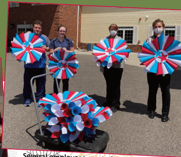
Several employees created seasonal decor and tied fleece blankets for senior living centers in Belle Plaine, Le Sueur (above), New Prague, Shakopee and Waconia, among others.