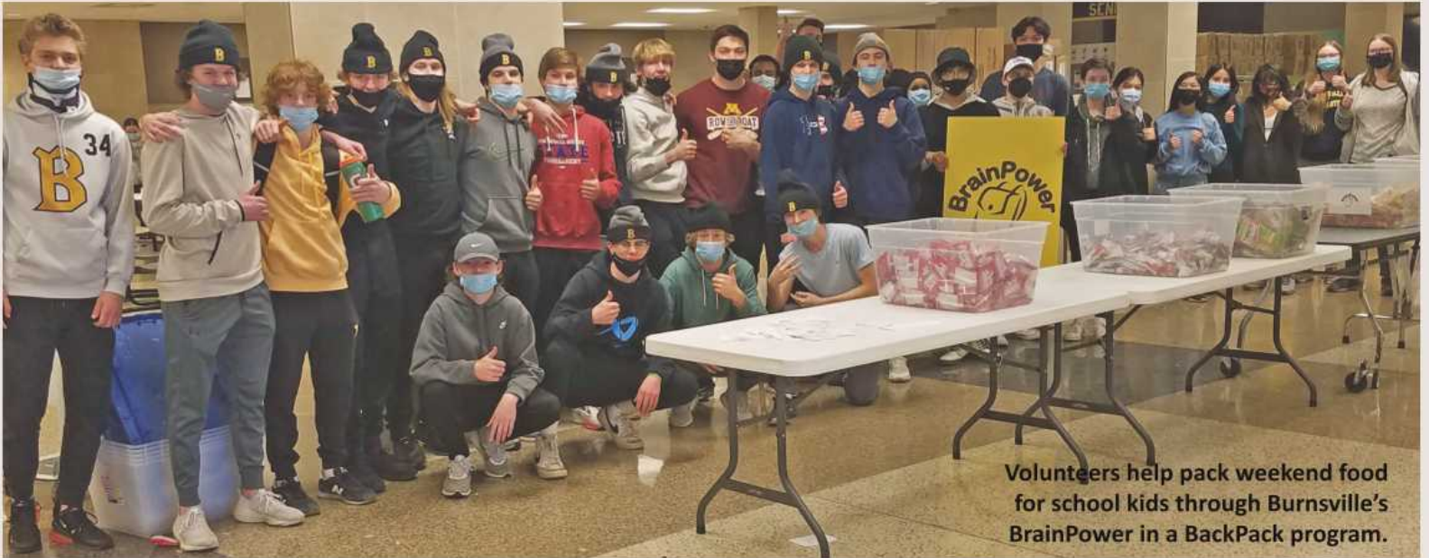
Volunteers help pack weekend food for school kids through Burnsville's BrainPower in a Backpack program.

Shakopee Parks and Rec -$935 women's water safety